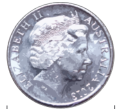
28.52mm - 20c coin

THE BELOW MEASUREMENTS MATCH THE INSIDE DIAMETER & CIRCUMFERENCE OF THE RING